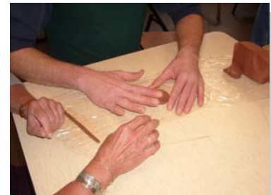
We even rolled little balls to be use for feet.