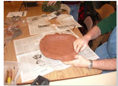
Using a pie plate as a mold.