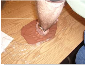
Some people flattened their clay by hand.