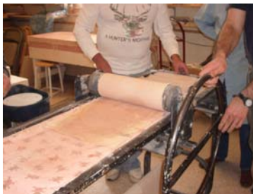
Some people used the clay rolling machine in the Center's Ceramic Shop.