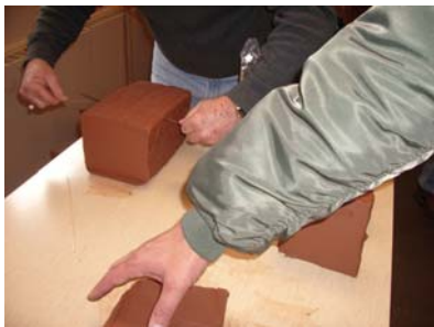
With the help of a thin wire, we divided the blocks into several one pound pieces