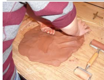
Others opted to use a pastry rolling pin to flatten theirs.