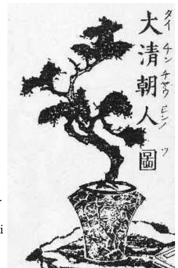
Nagasaki-e, 17th Century

www.phoenixbonsai.com/BonsaiHistory.html and read more.