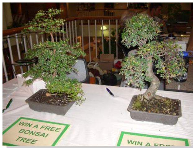
Raffle Trees. The one on the left is a Black Olive ( Bucida spinosa ) and the one on the right is a Chinese Elm ( Ulmus parvifolia ).

raffle. These had to be the best trees we have ever had for raffle.