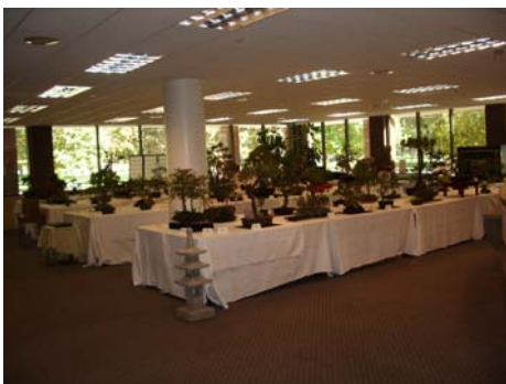
Last years show without the fabric dividers. Makes a big difference, doesn't it?